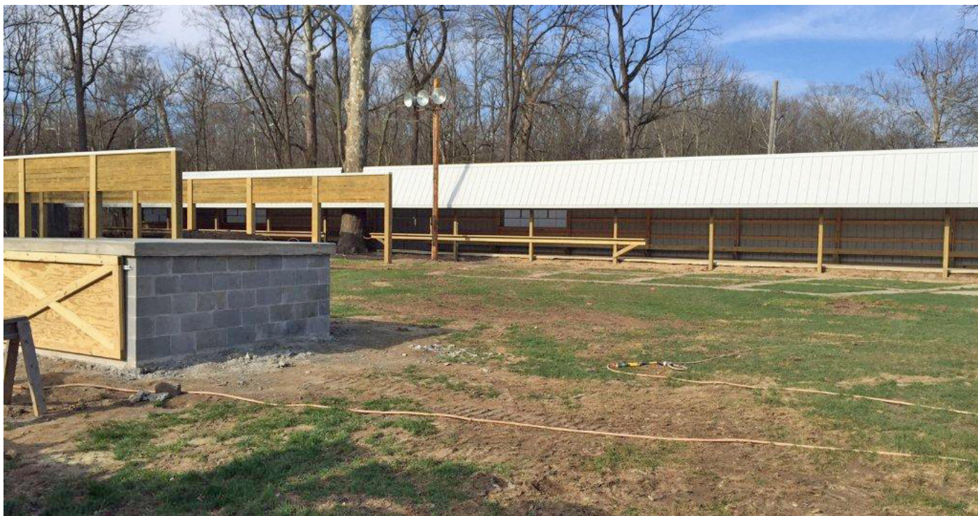
Marion County Fish & Game has recently undergone major renovations to their existing range.