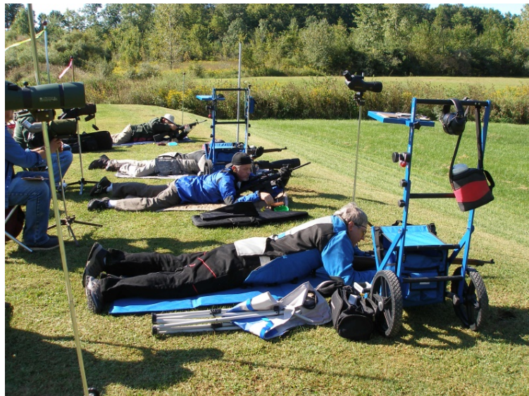
Modern Military, 1903 and 1903A3 rifles were used on the line during the CMP Games.