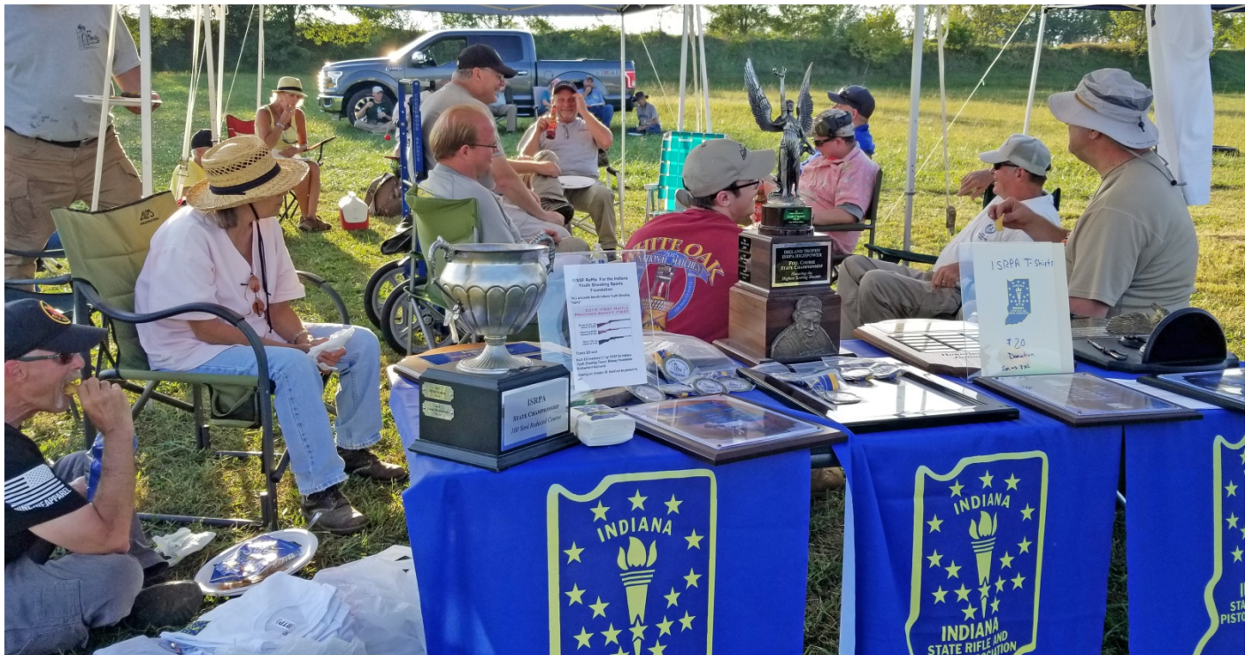
Competitors enjoy a cookout under the SMT tent while waiting for match results following the High Power Course State Championship.