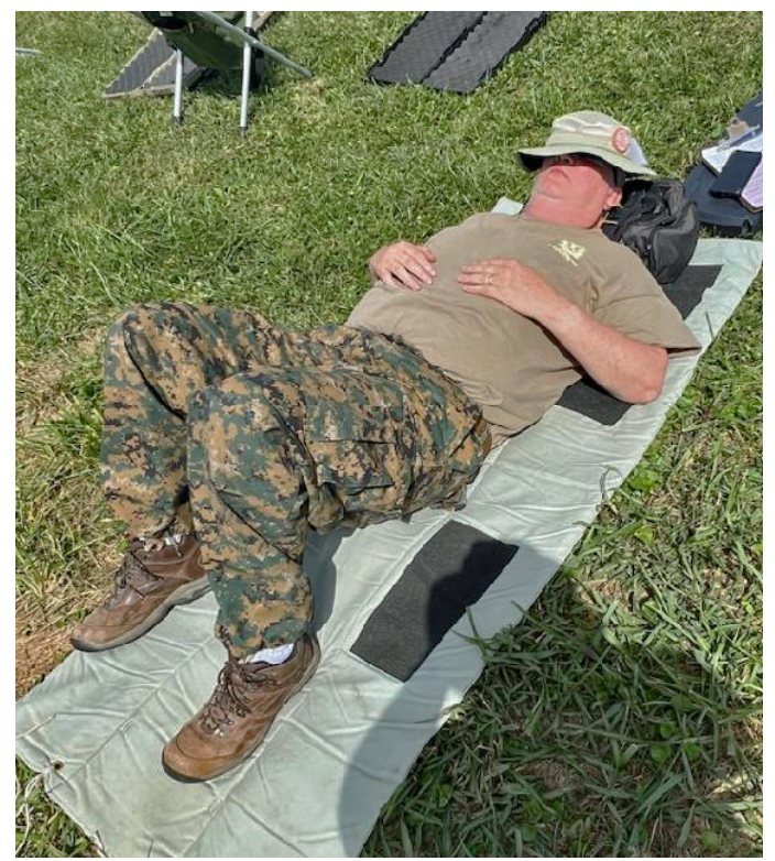
Competitor took the "At ease" command literally.