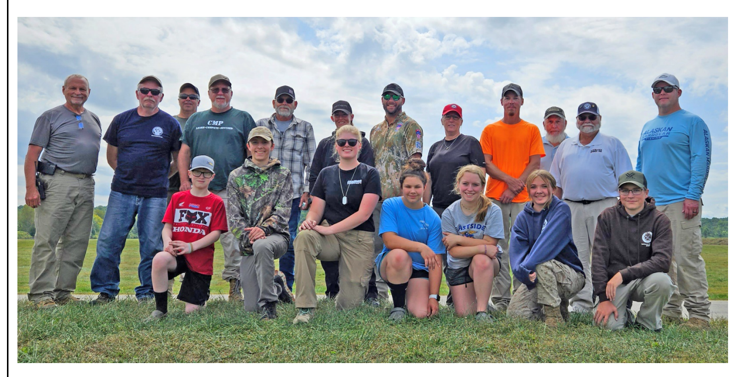
Competitors lined up for the after match photo op.

We had great representation from our Indiana Juniors, being 7 of the 19 competitors. Special thanks go out to all of the parents who gave up their weekend to bring the juniors to the match – without you, it could not have happened! These young ladies and gentlemen are the future of our sport!