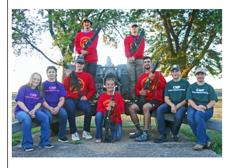
Indiana Juniors at Camp Perry

The Junior High Power Shooters of Indiana were well represented at the USMC Advanced Firing School and the USAMU Small Arms Firing School at the Camp Perry National Matches. FWRR Juniors, in purple and green T-shirts attended the Small Arms Firing School and other Indiana Juniors, primarily from Wildcat Valley, in the red sweatshirts, attended the advanced USMC class.