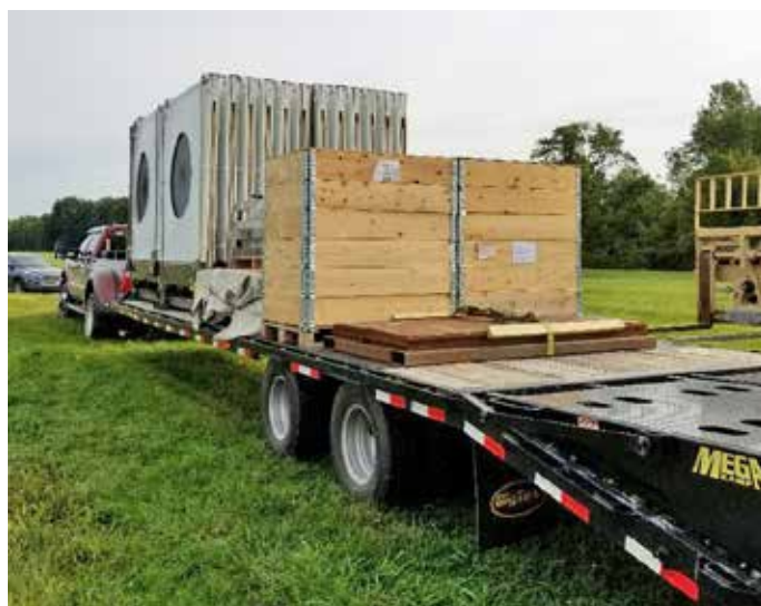
Delivery of the CMP electronic targets