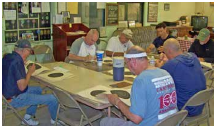
Scoring after the match