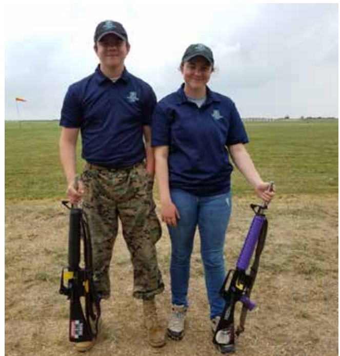
ISRPA Junior Team