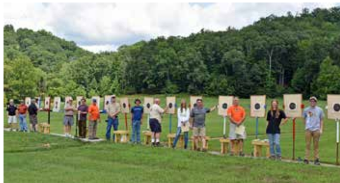
Scoring at the 50 yard line for the July 2700