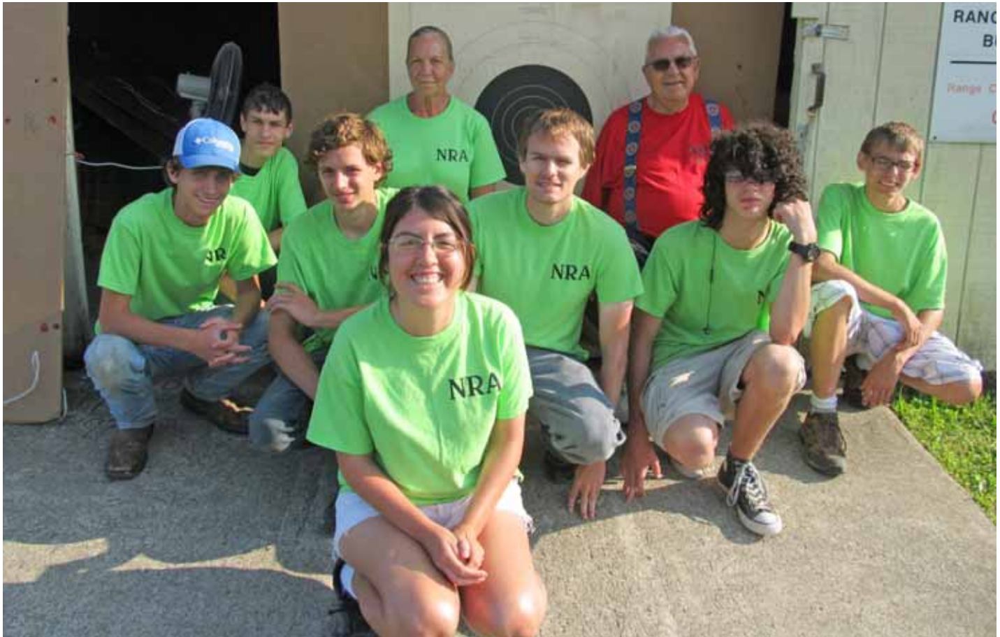
Range staff preparing targets for the next match