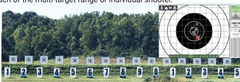
SOLO Multi-Target Range System

The World Leader in Open Sensor Rifle Target Systems