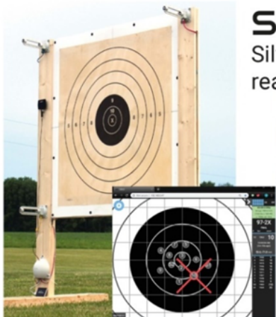
SOLO Stand-Alone System

Silver Mountain Targets brings the technology of an E-target within reach of the multi-target range or individual shooter.