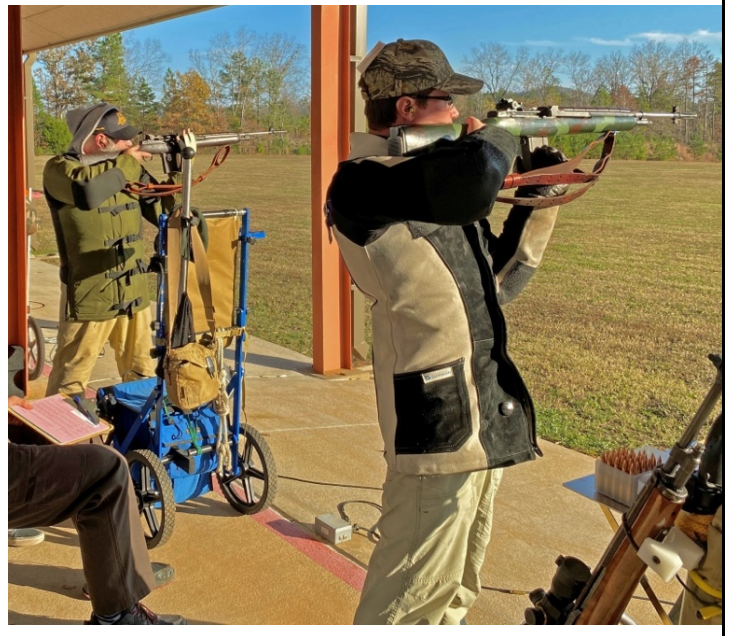
ISSN Jan-Feb-Mar 2023 Page 8

The Excellent in Competition (EIC) match fired on Friday morning had 97 shooters. In an EIC match similar to the M16 match shooters can earn points toward their distinguished rifleman's badge. These EIC matches bring a bit more pressure than regular matches do, because you are only allowed to compete in five EIC