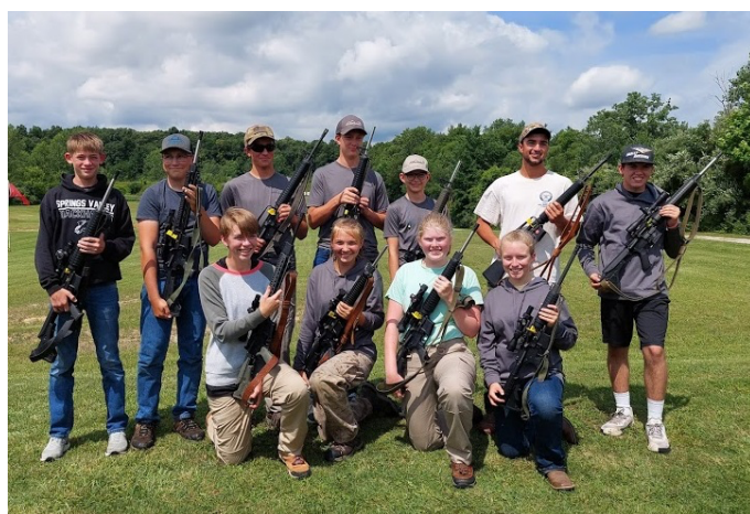
2021 Junior State Championship Competitors

When was the last time you took a junior shooter to the range?