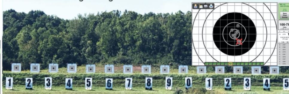
SOLO Multi-Target Range System

The World Leader in Open Sensor Rifle Target Systems