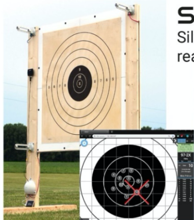
SOLO Stand-Alone System

Silver Mountain Targets brings the technology of an E-target within reach of the multi-target range or individual shooter.