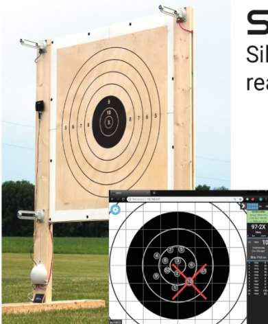
SOLO Stand-Alone System

SOLO a new generation of electronic target