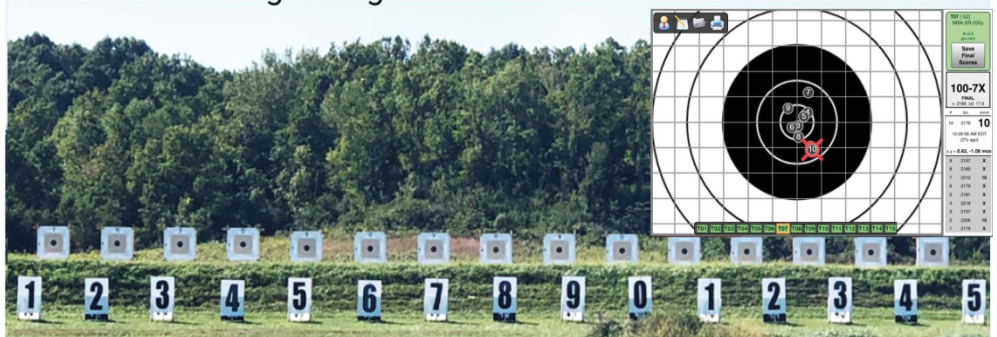
SOLO Multi-Target Range System

Silver Mountain Targets brings the technology of an E-target within reach of the multi-target range or individual shooter.