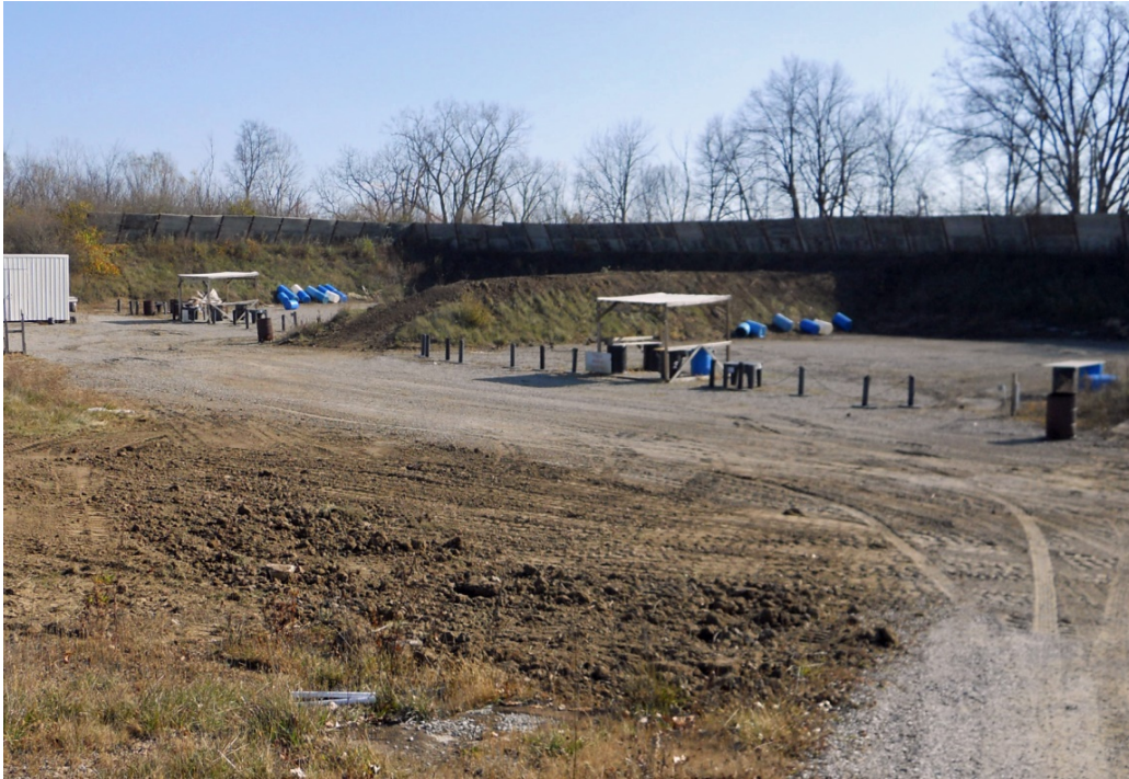
The new pistol stations almost completed

The initial Hoosier Home Range Hundred Match was well received last summer and the sponsors have decided to do it again this year. The Match format will remain much the same; an 80-round Regional Match shot at 100-yards on reduced targets. Matches will be scheduled in August and September and a maximum of three matches may be scheduled at any Club.