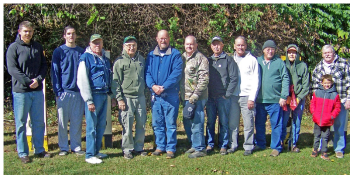
Competitors at the Anderson fall smallbore match.