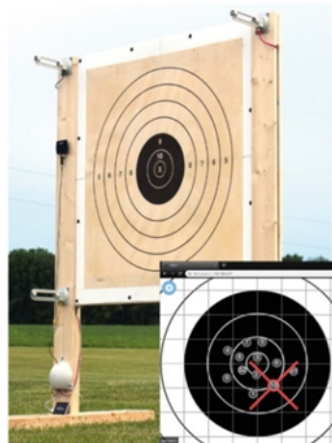
SOLO Stand-Alone System

SOLO a new generation of electronic target