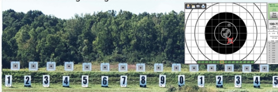
SOLO Multi-Target Range System

Silver Mountain Targets brings the technology of an E-target within reach of the multi-target range or individual shooter.