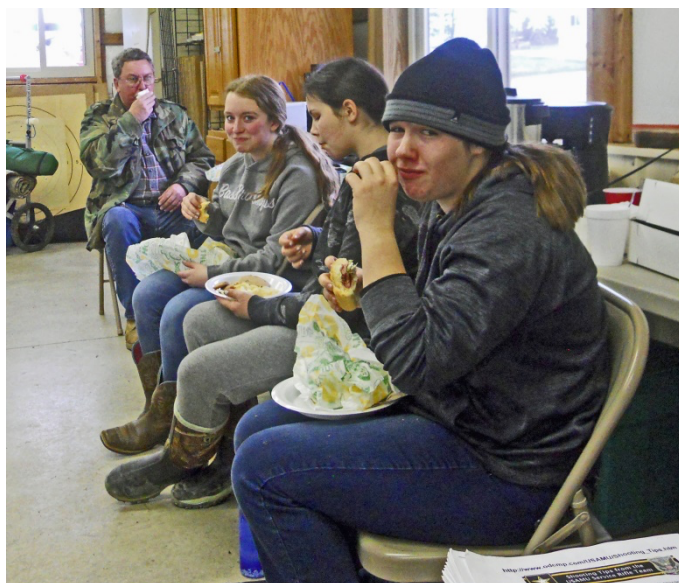
The first rule for any event involving juniors is “Feed them and they will come”.

For more information on the SCATT systems go to: scat.com