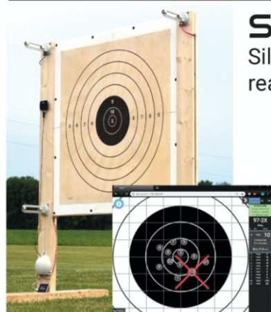
SOLO Stand-Alone System

SOLO a new generation of electronic target