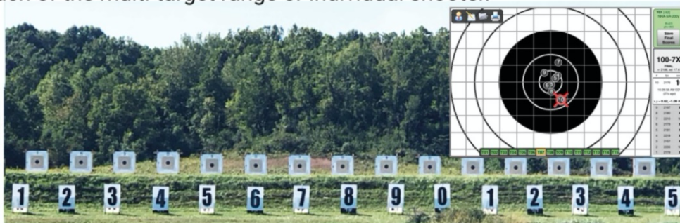
SOLO Multi-Target Range System

Silver Mountain Targets brings the technology of an E-target within reach of the multi-target range or individual shooter.