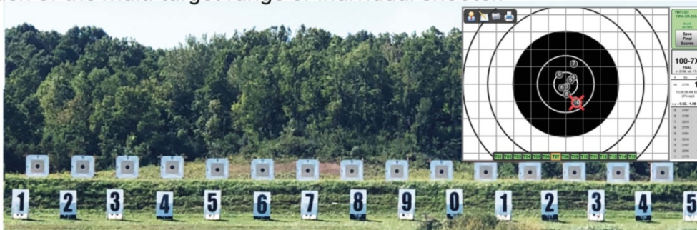
SOLO Multi-Target Range System

Silver Mountain Targets brings the technology of an E-target within reach of the multi-target range or individual shooter.