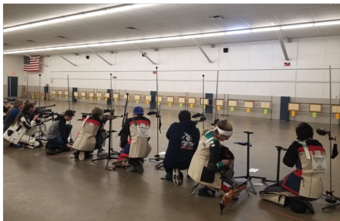
Precision competitors in the kneeling position