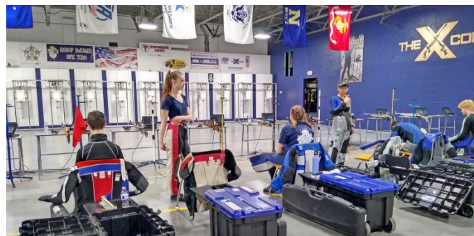
Competitors setting up and mentally preparing before the International Air match.