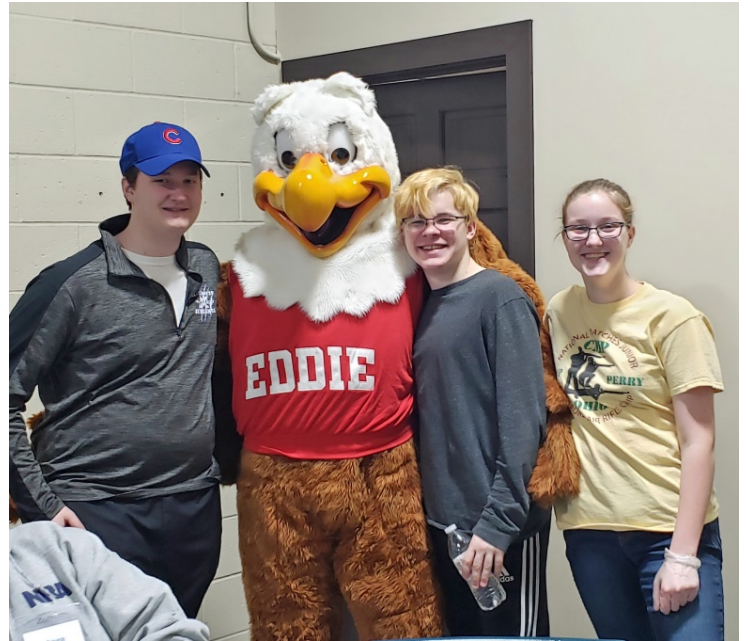
Above, American Heritage Girls gather around Eddie Eagle for a photo-op.

The very popular supplemental station is an escape room with a parallel of the theme of the event. This year's theme, GI Jane, had participants trapped in Radar O'Reilly's office with a desperate need to get out and warn the surgeons of "incoming wounded". No one ever escapes without a little assistance from the puzzle master. One thing is for certain, the girls and their families escape the day with a smile on their face, their shooting sports badge, a themed t-shirt, and a desire to shoot a rifle again very soon.