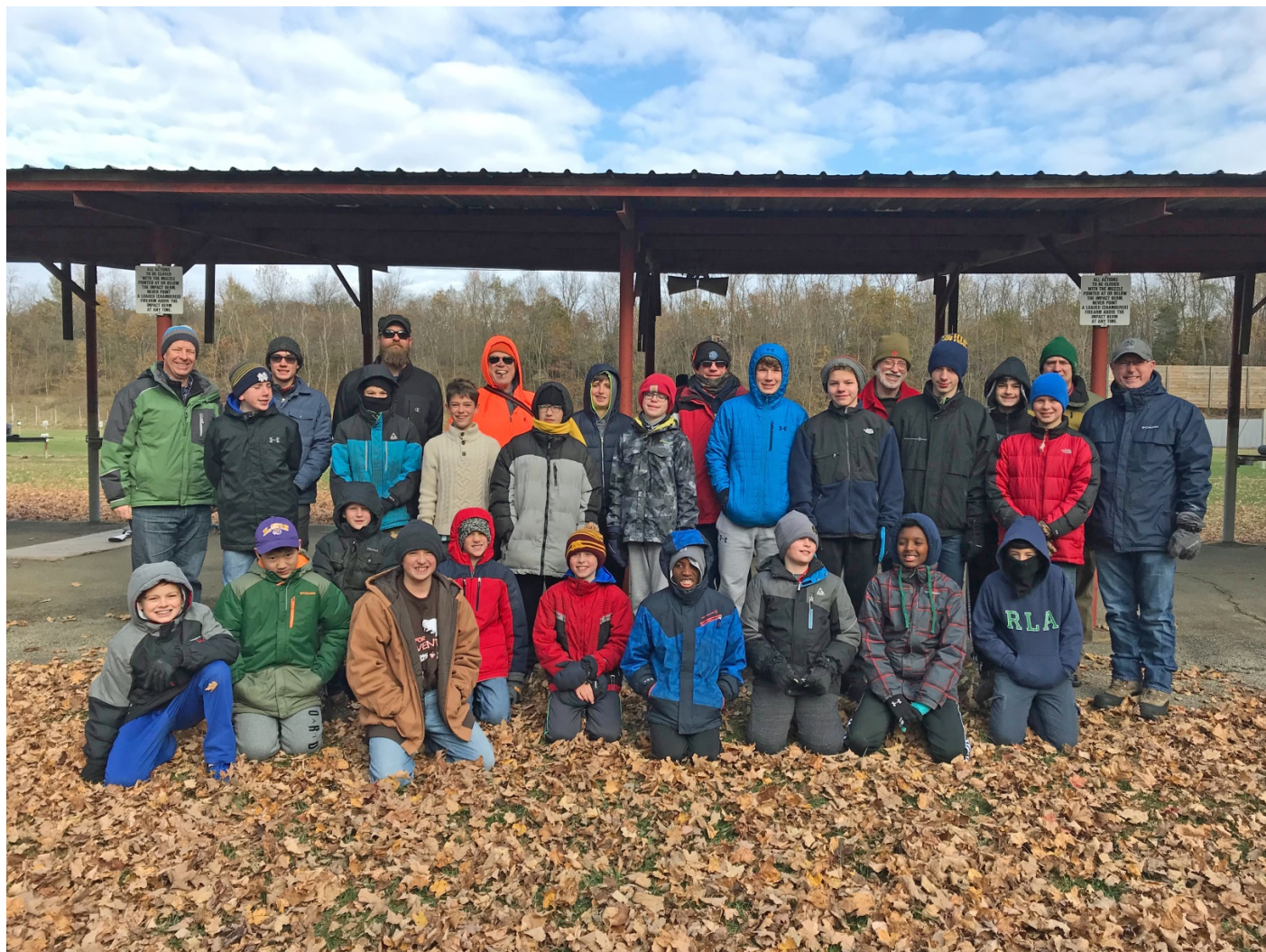
Boy Scout Troop 325, South Bend spent a day on the rifle range. More on page 17.