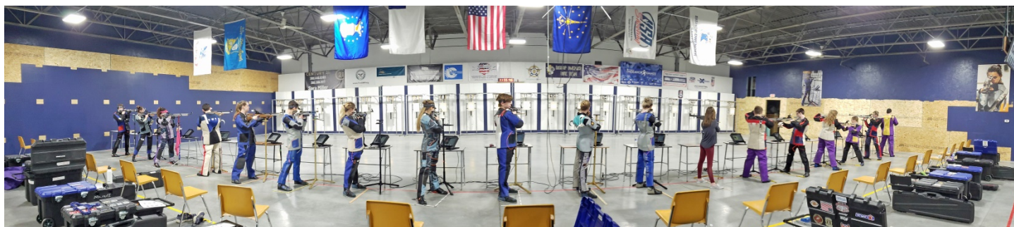
Panoramic view of the X-Count firing line

This year's ISRPA Lorenzen Junior Rifle State Championship match was abuzz with activity. Early indicators suggested a shattering of the previous state attendance record. In 2018 that record was broken with 267 junior athletes participating. This year, more than 310 junior athletes had registered. This was more than a 15% increase over the 2018 record. The growth was due to the increasing popularity of the match, the growth of the sport in the state, and the generous offer of Indiana Youth Shooting Sport Foundation to contribute the amount of the match fees to the existing MidwayUSA Foundation trust of each team.