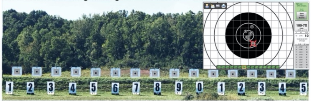
SOLO Multi-Target Range System

The World Leader in Open Sensor Rifle Target Systems