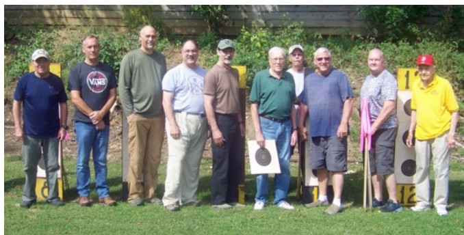
Anderson smallbore competitors