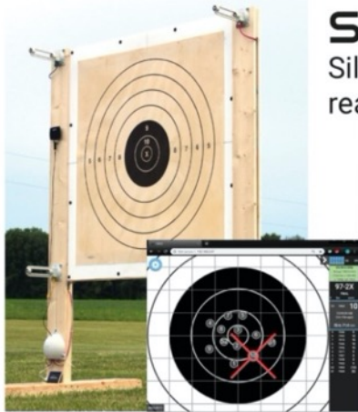
SOLO Stand-Alone System

Silver Mountain Targets brings the technology of an E-target within reach of the multi-target range or individual shooter.