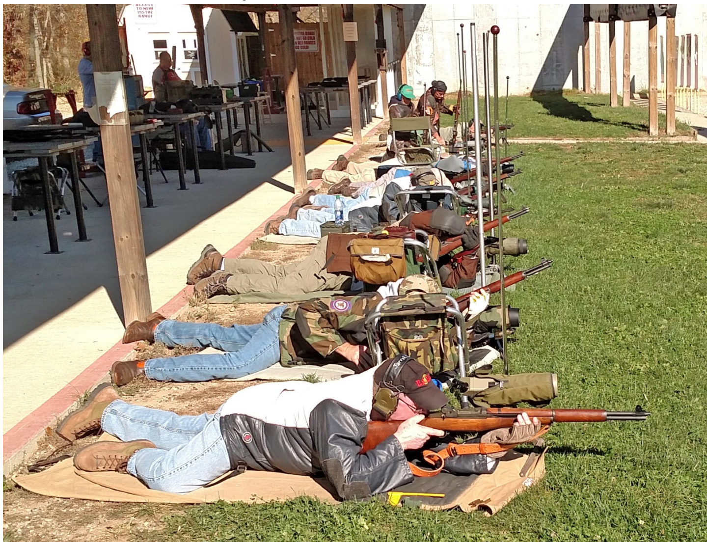
The Fall Creek Valley Conservation Club hosted a High Power rifle match May 6 th .