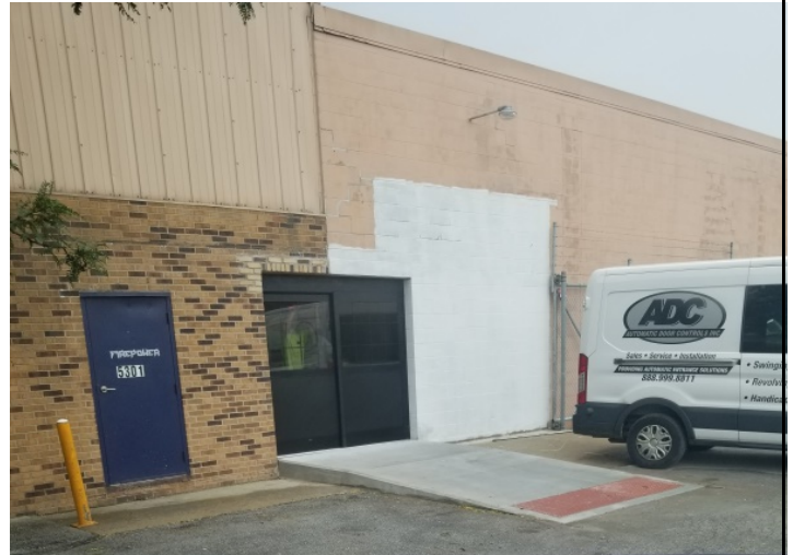
The new entry for persons with disabilities

During the 2018 FNRA grant meeting, directors made it clear...they wanted to support our veterans. For the last three years, The X Count in Fort Wayne has been hosting a Veteran's Airgun series for disabled veterans from Northeast Indiana ( below left ). This was a great opportunity for our veterans but getting into the building posed a unique challenge. This year the Indiana FNRA chose to do something about this...and in May their generous donation was put to good use. The flooring on the range is all one level and the entry way is no longer waiting for someone on the inside to open an overhead door. More improvements are just around