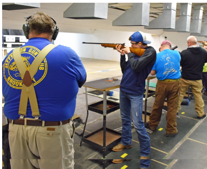
Fire Sporter Rifle match held at the SIRPC indoor range in Georgetown.