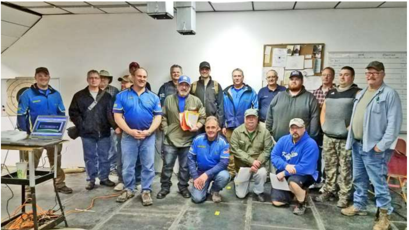
The SIRPC hosted an F-Class clinic February 24, which was open to the public.