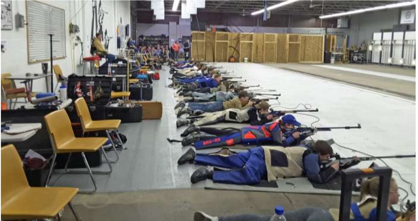
Belmont High School athletes compete in smallbore prone.