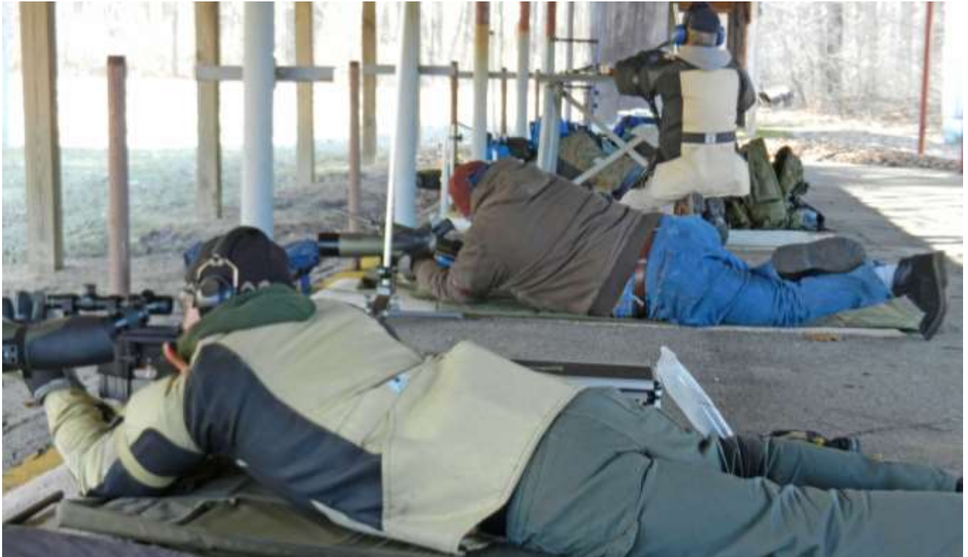
This group of hardened rifle shooters braved 33 degree weather on March 4 th for opening practice at Chief Wa-Ke' De Range, outside of Bristol.