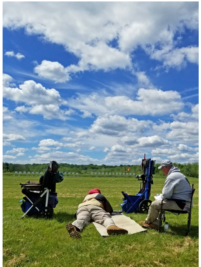
What a beautiful day it was to be out on the firing line at Camp Atterbury

Weather was awesome and the target arrays performed beautifully...some great shooting for a great weekend. This being our first collaborative