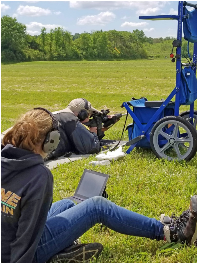
Spotter is monitoring the laptop for shot placement and value...then relaying that information to the rifleman.