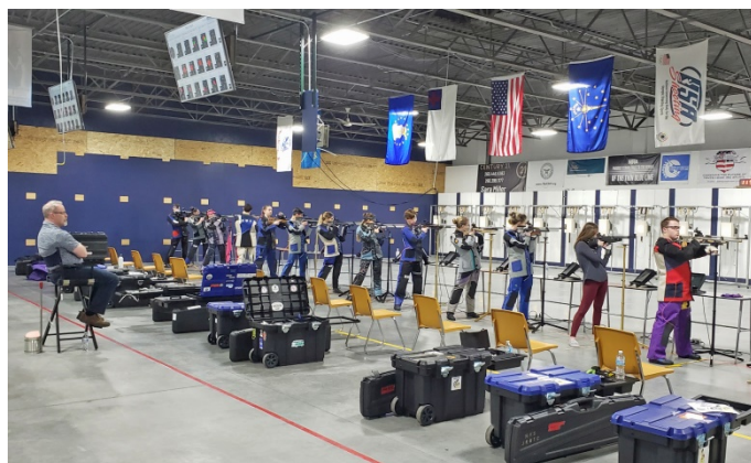
The Junior Rifle Championship competitions in the first weeks before the Covid restrictions were put into place.