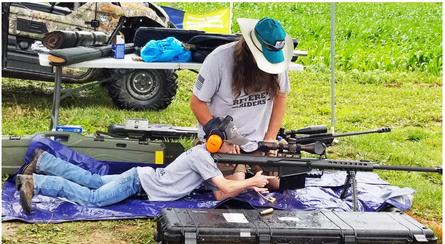
(Below) The grin on this youngster's face after firing the 50 cal. Barrett was something to behold.