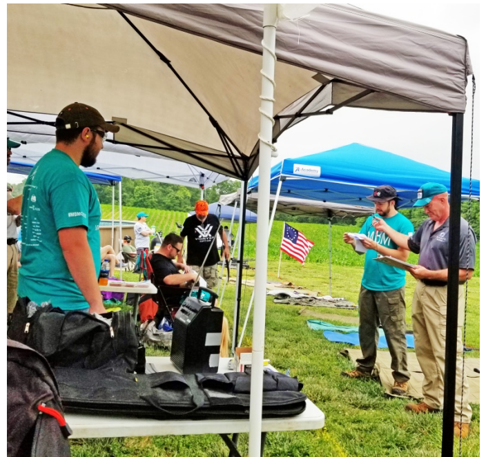
The first order of business before the fun begins is the reading of the range safety rules.